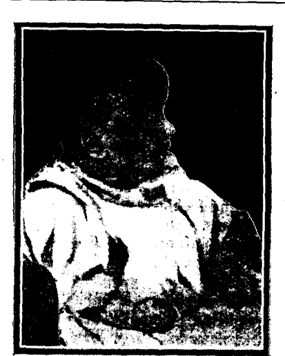
Healthy, precocious infant.

only one parent is unstable their child may escape, that the offspring seldom escapes the taint when both parents are unstable. He considers recurrent insanity a very grave danger, and that it is positively criminal to withhold the